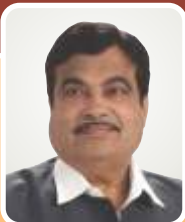
Shri Nitin Gadkari

An initiative is planned by Shri Nitin Gadkari , Hon'ble Union Minister For MSME, Road Transport & Highways to promote MSMEs and to motivate youth to start their own enterprise. Khasdar Audyogik Mahotsav - is a combination of Conferences and Industrial Exhibition which will provide an excellent platform to entrepreneurs and MSMEs to explore various opportunities. Khasdar Audyogik Mahotsav will be held from 14th to 16th March 2020 at South Central Zone Cultural Centre, Nagpur.